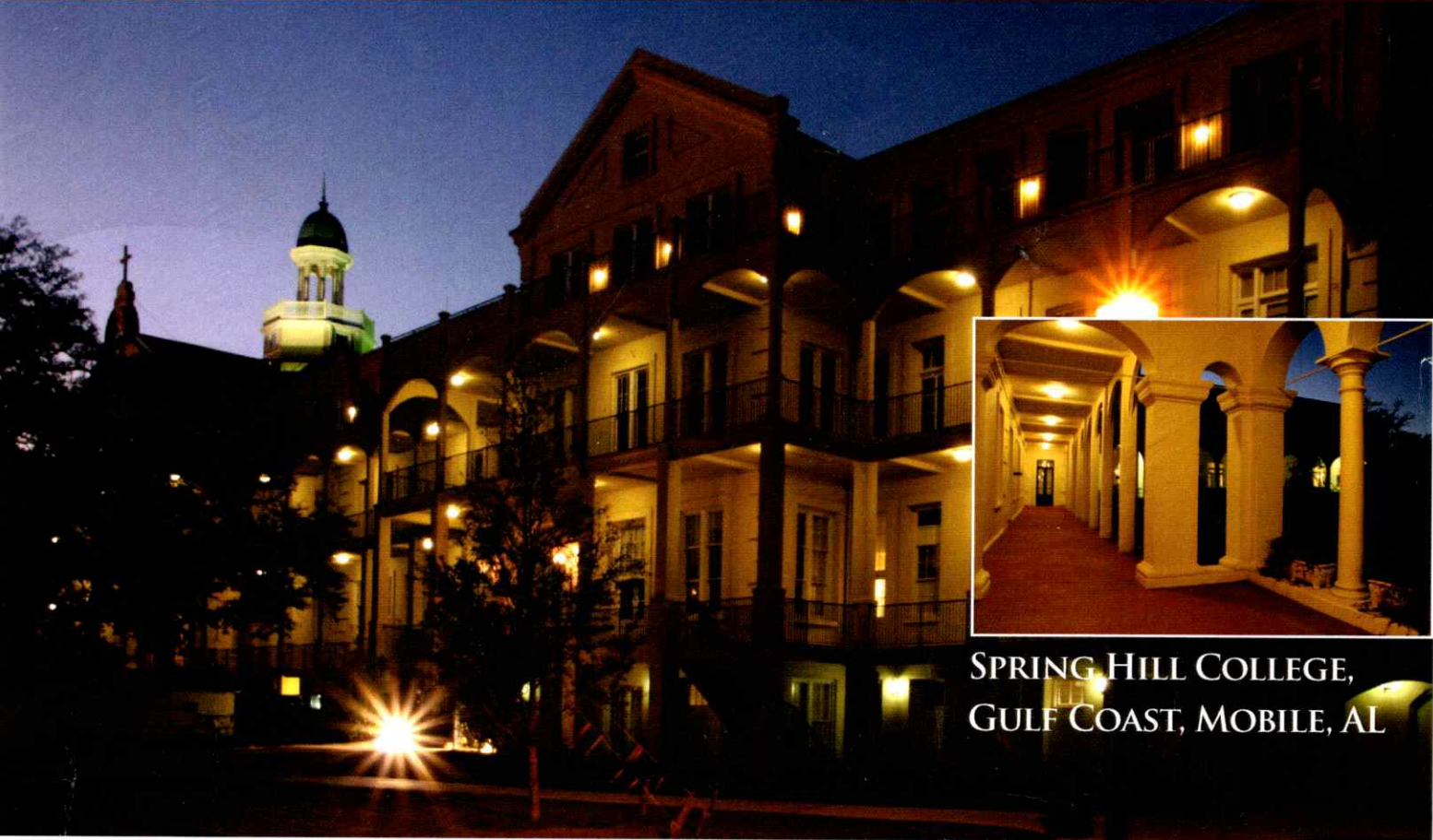
SPRING HILL COLLEGE, GULF COAST, MOBILE, AL

THIS RECONSTRUCTION WAS SO AUTHENTIC THEY EVEN RESTORED A MISTAKE*